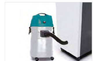
DCS-500 COMPLETE DUST COLLECTION SYSTEM to provide dust free padding mats.