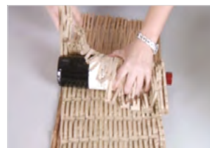
FILLING MATERIAL FROM CORRUGATED CARDBOARD for safe deliveries of any product.