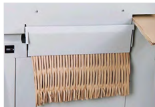
ADJUSTABLE CUSHIONING VOLUME OF HARD CARTON