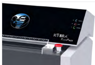
REMARKABLE TOUCH SCREEN PANEL